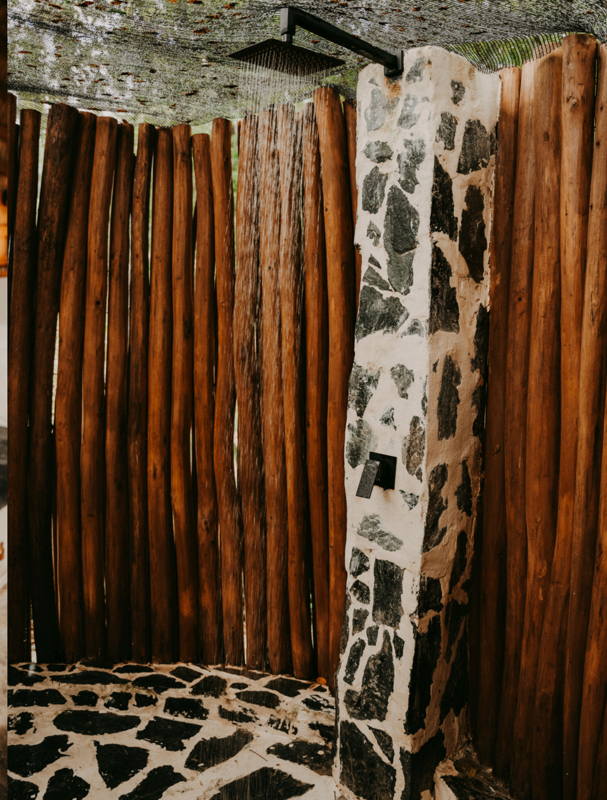
2 Jungle Cabins ~ 4 guests