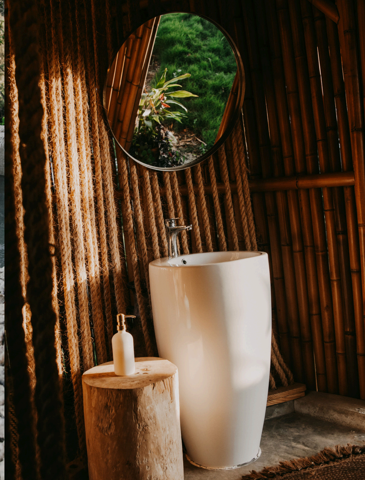
Luxury Glamping ~ 2 guests