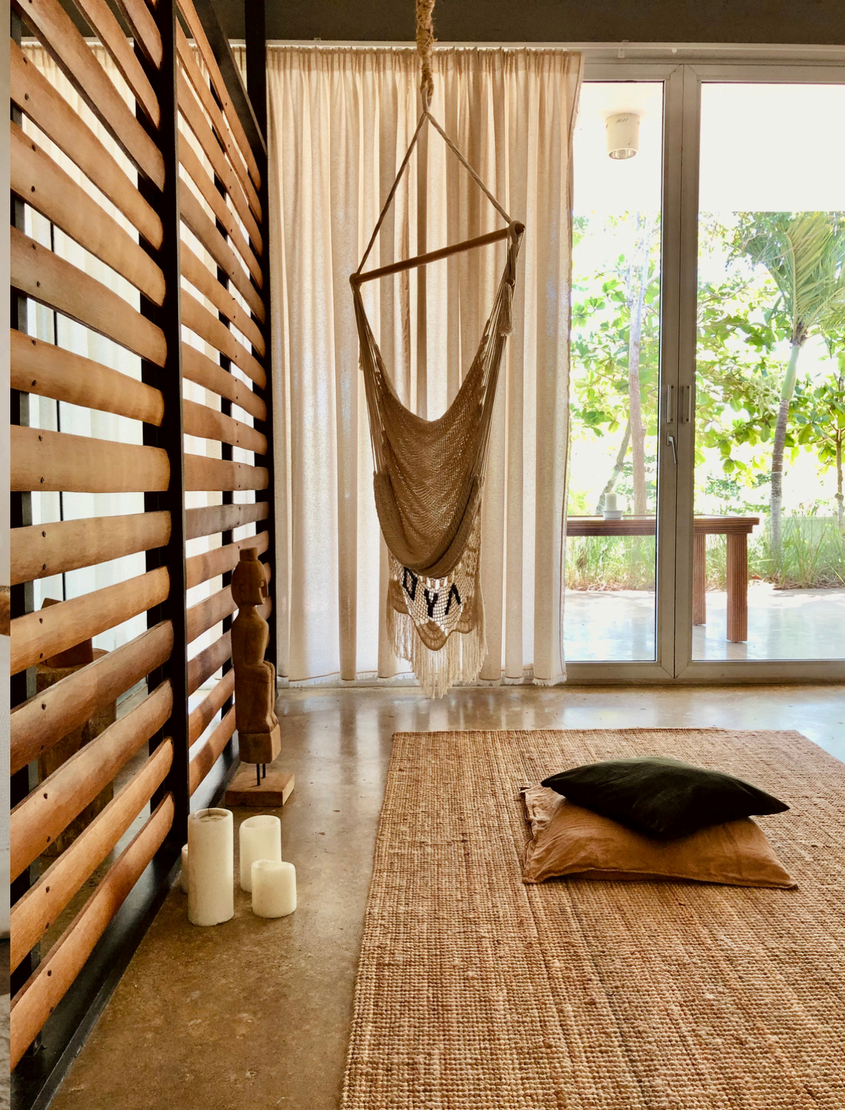
Air Villa with 4 upscale Rooms ~ 10 guests